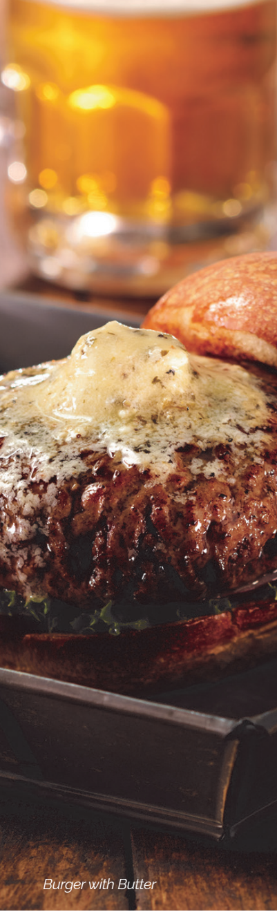
Burger with Butter