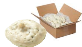
Garlic Herb Butter Dollop