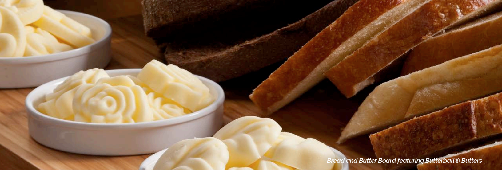
Bread and Butter Board featuring Butterball® Butters