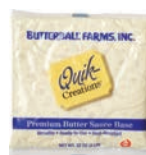
Quik-Creations® Premium Butter Sauce