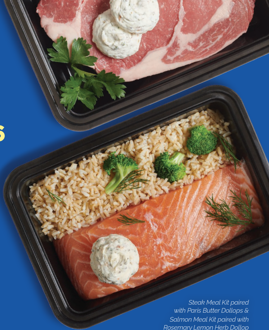
Steak Meal Kit paired with Paris Butter Dollops & Salmon Meal Kit paired with Rosemary Lemon Herb Dollop

Here are their Top 5 Butter Flavors For Protein for the year.