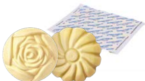
Pop-Out® Rose & Rosette