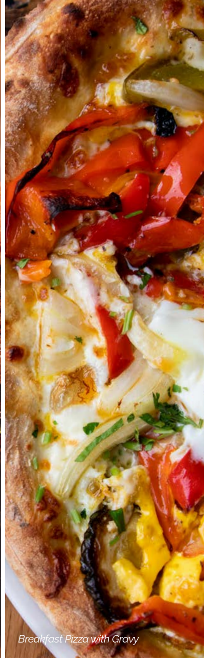
Breakfast Pizza with Gravy