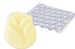
Pop-Out® Budding Rose