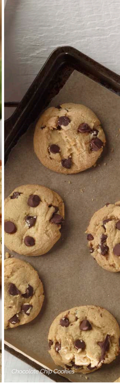
Chocolate Chip Cookies