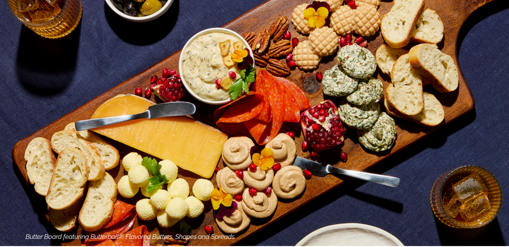
Butter Board featuring Butterball® Flavored Butters, Shapes and Spreads