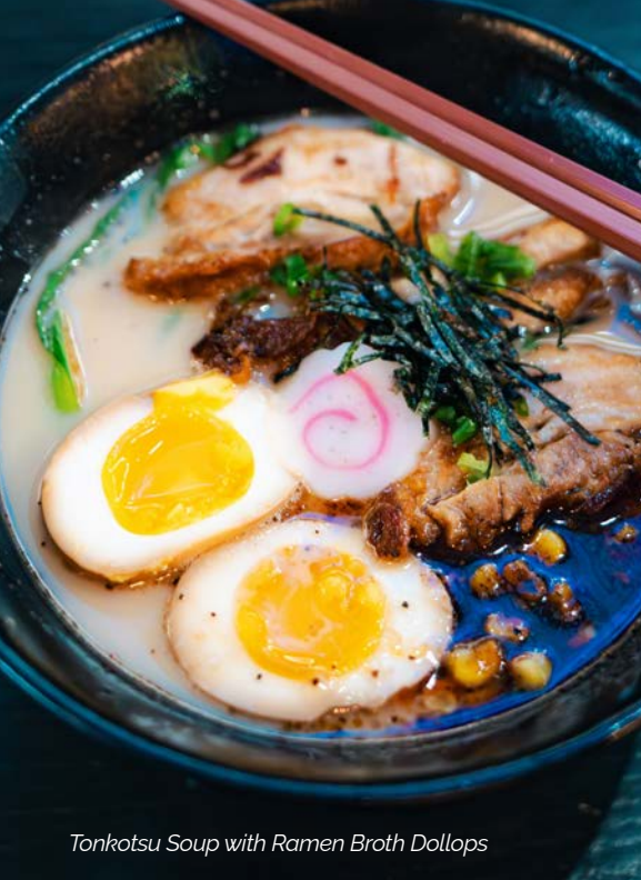
Tonkotsu Soup with Ramen Broth Dollops