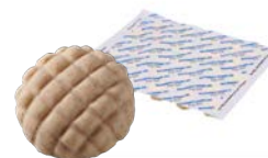
Pop-Out® Honey Butter Hive