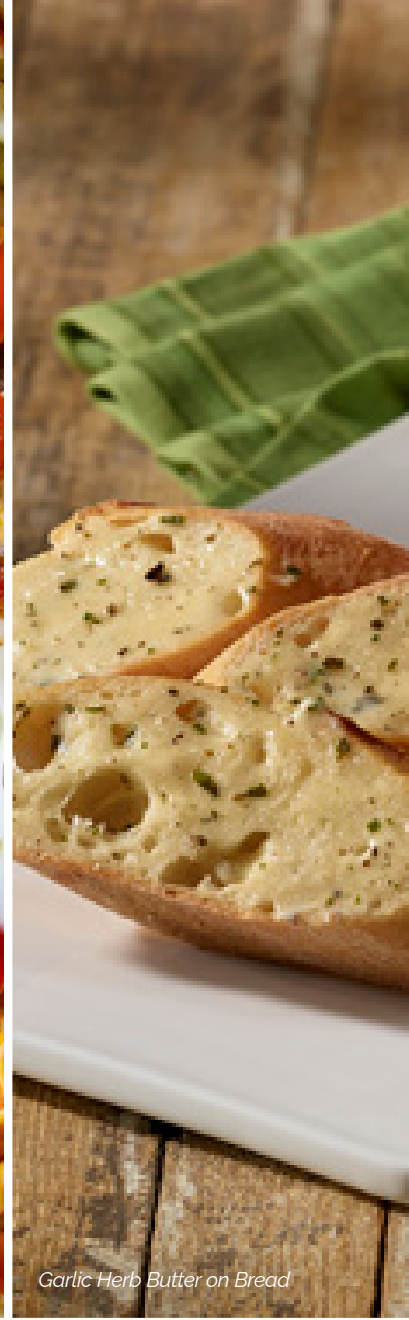
Garlic Herb Butter on Bread